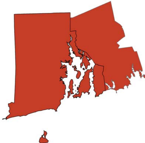
Providence-New Bedford-Fall River, RI-MA

**On January 1st, 2013 the Gallup-Healthways Well-Being Index methodology changed from 1,000 surveys per day to 500. In this report, we have combined 2012 & 2013 data for all U.S. Metropolitan Statistical Areas (MSAs) to ensure adequate sample size.